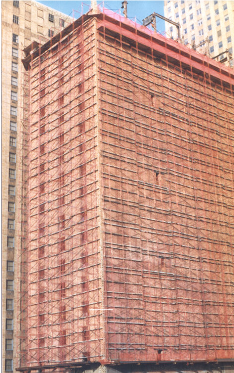
CAREW TOWER PARKING GARAGE DEMOLITION